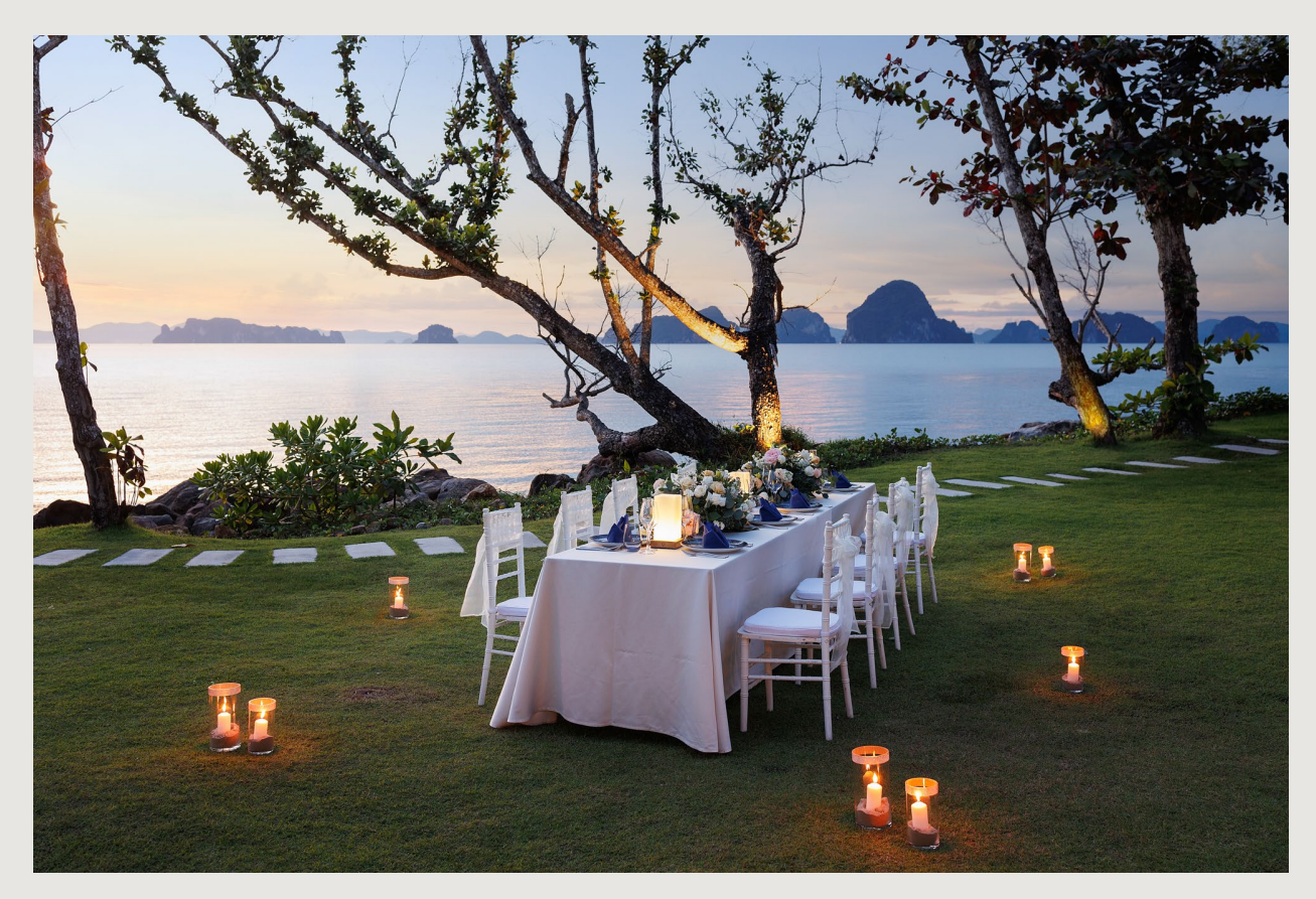
WEDDING RECEPTION AT OUR BEACH LAWN