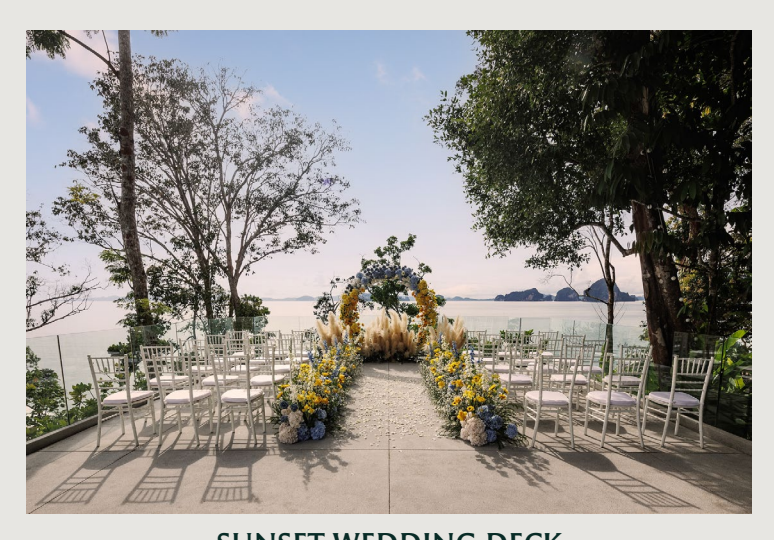
SUNSET WEDDING DECK Accommodates up to 30 people