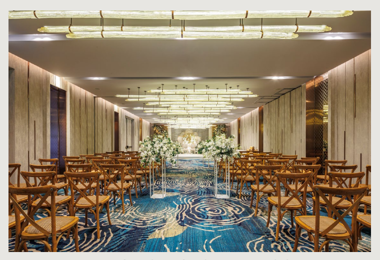
MUANG MORAGHOD BALLROOM Accommodates up to 80 people