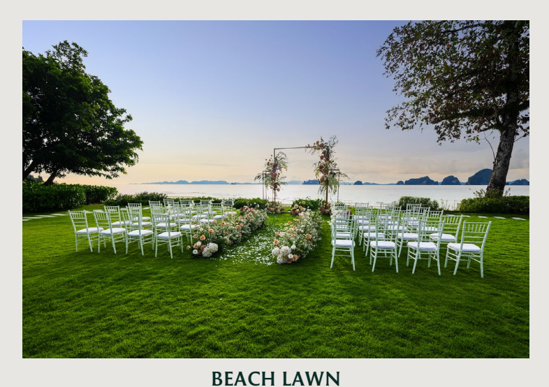
Accommodates up to 80 people