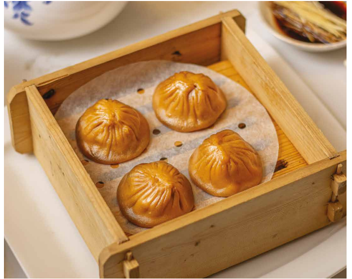
☆ 北海道昆布高湯蟹肉小籠包 Steamed "Xiao Long Bao" filled with Hokkaido Kombu Soup and Crab Meat