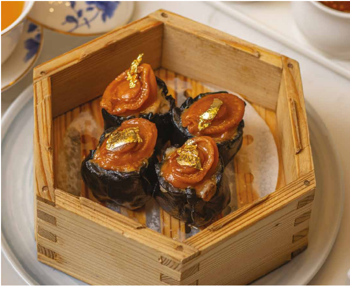
☆ 鮑魚燒賣皇 Steamed Prawn and Chicken Dumpling with Abalone