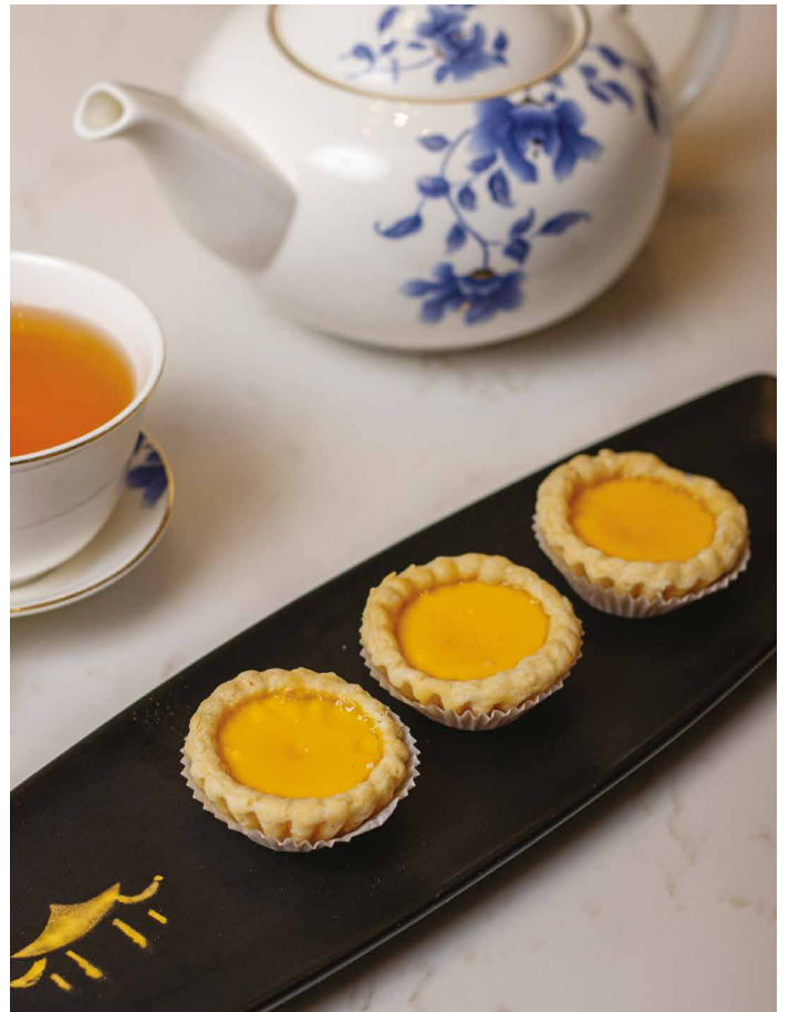
酥皮蛋撻 🍷 🍷 Slow Oven-baked Fragrant Egg Tart