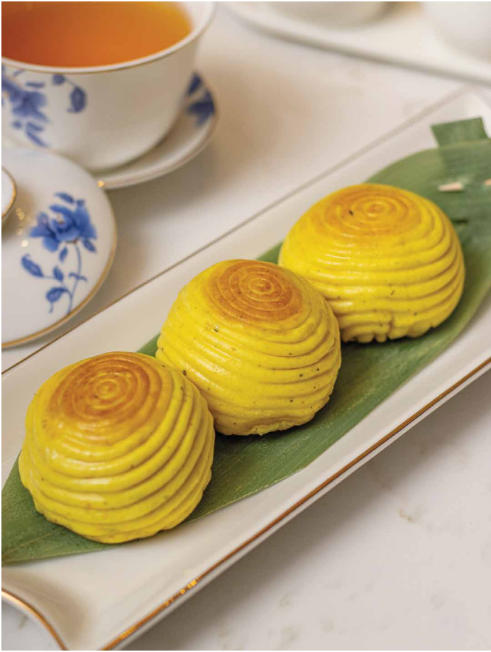
☆ 玉亭軒黃金醬皇生煎包 Jade Pavilion's Golden Butter Bun filled with Cheddar Cheese