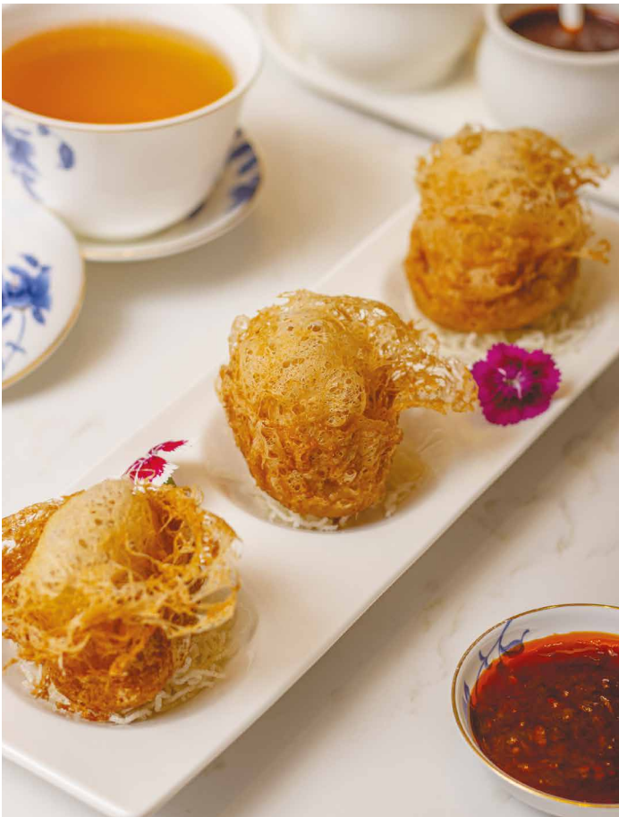
蜂巢荔香芋盒 Crispy Yam Puff filled with Chicken and Mushroom