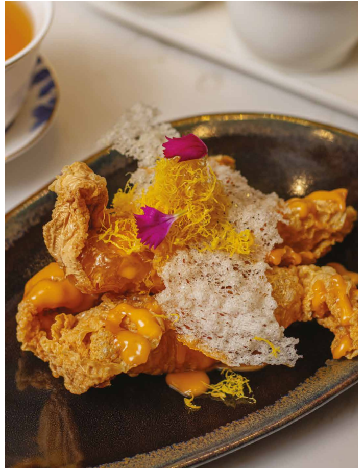
香芒沙律鮮蝦腐皮卷 🍷 Pan-fried Seafood Beancurd Roll topped with Mango Mayonnaise