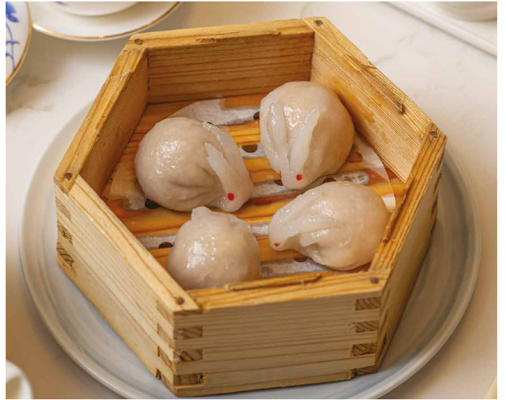
江珧玉兔蝦餃 Steamed Alaskan Scallop Dumpling with Apple