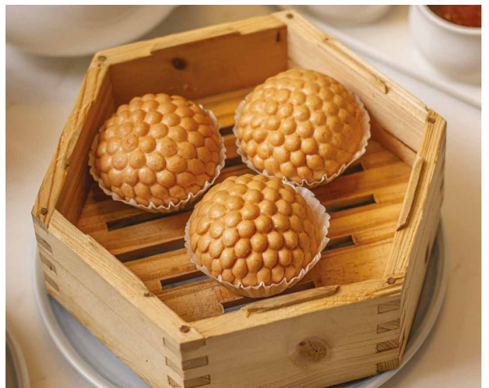
玉亭軒蜜桑海棠流沙包 中 Jade Pavilion's Tropical Fruit Custard Bun