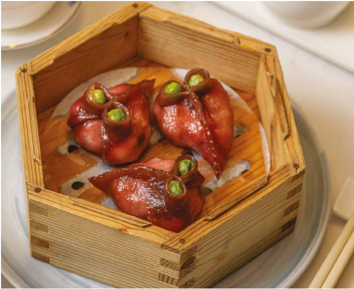
湘瑩鱈魚餃 中 Steamed Silver Cod Fish Dumpling with Organic Beetroot