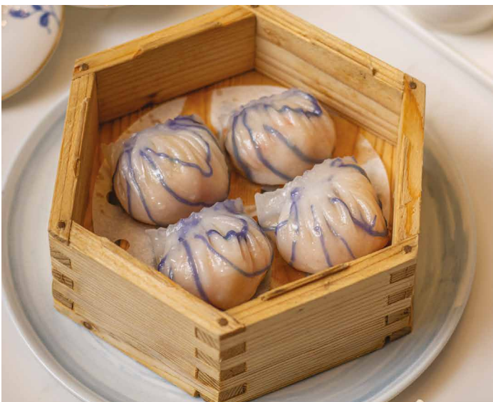
☆ 芋螢瑤瑤蝦餃 Steamed Crystal Prawn Dumpling with Sun Dried Scallop