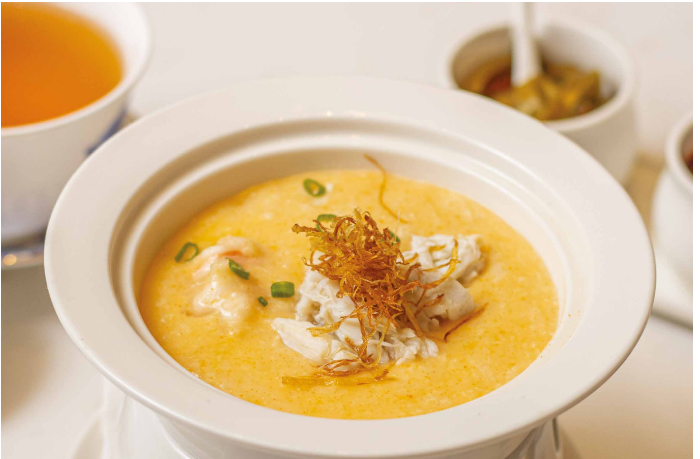
☆ 蟹皇海鮮粥 Congee with Seafood and Crab Roe