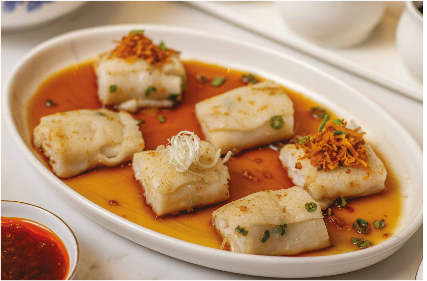
☆ 香煎極醬玉帶腸粉 Steamed Rice Roll with Pan-fried Scallop in Supreme Spicy Sauce