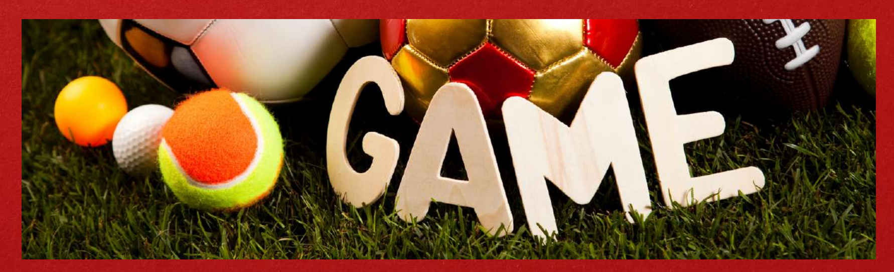
Plinko Game Spinner prize wheel Throwing Cans